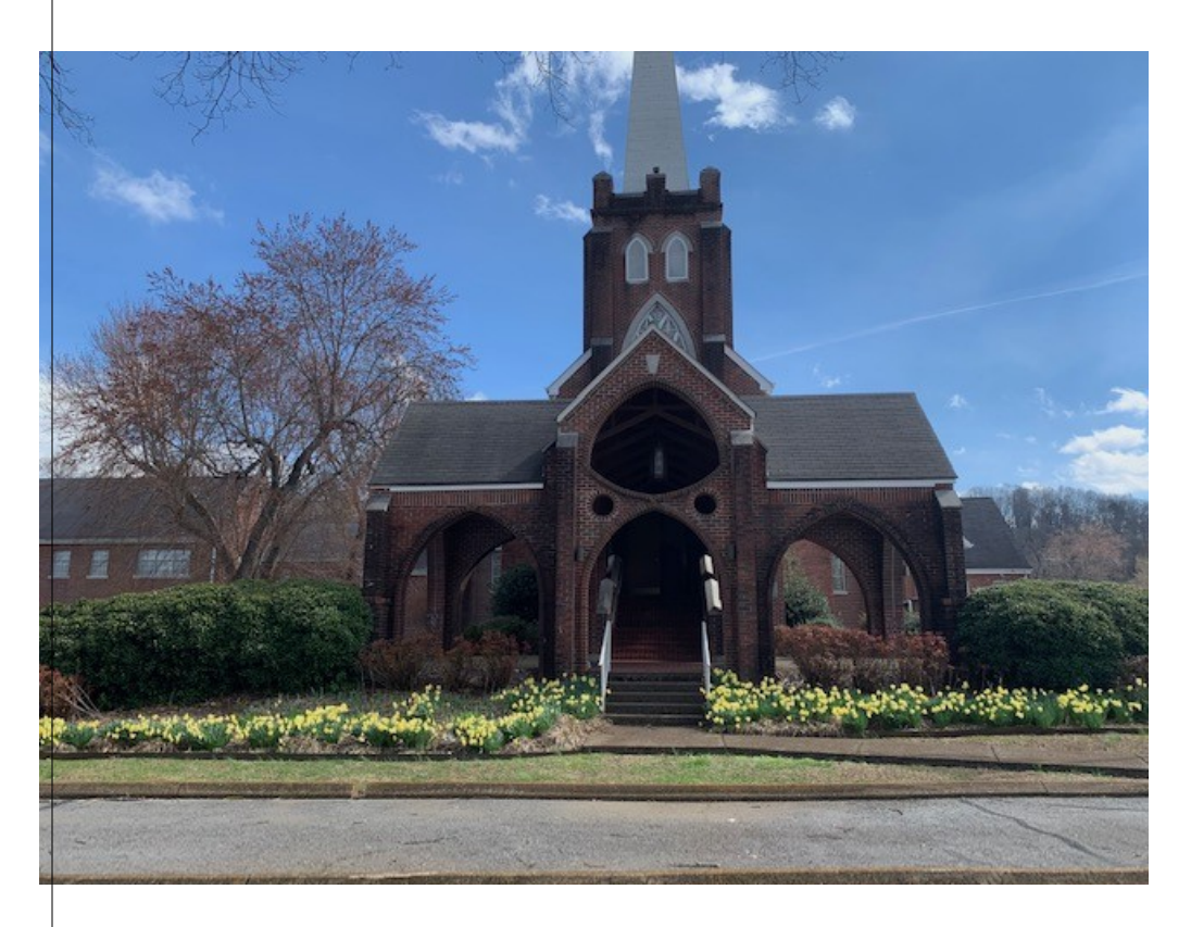
The daffodils were in full bloom on Ash Wednesday.