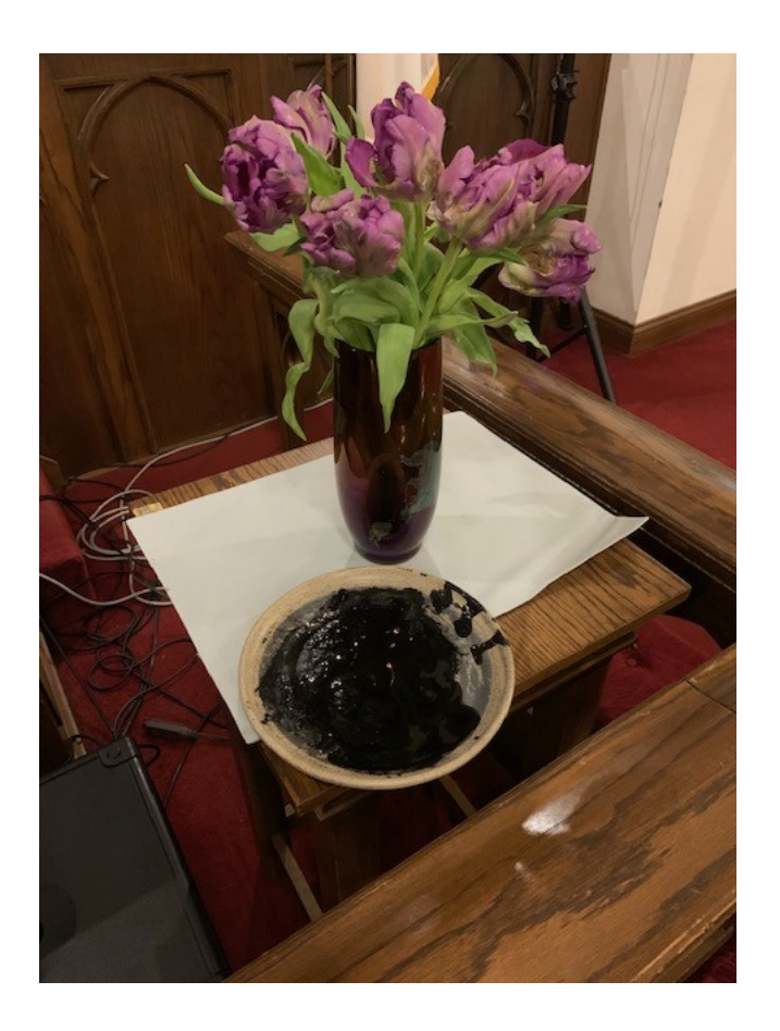
Lent has begun.