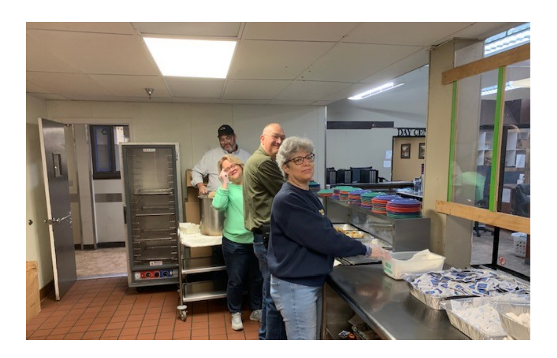
These wonderful people got up early to cook breakfast at the Community Kitchen on February 5<sup>th</sup>. If you would like to help with this ministry, please contact Kathy