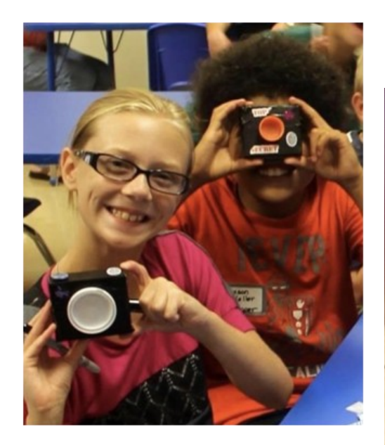
Trinity Volunteering at VBS 2018