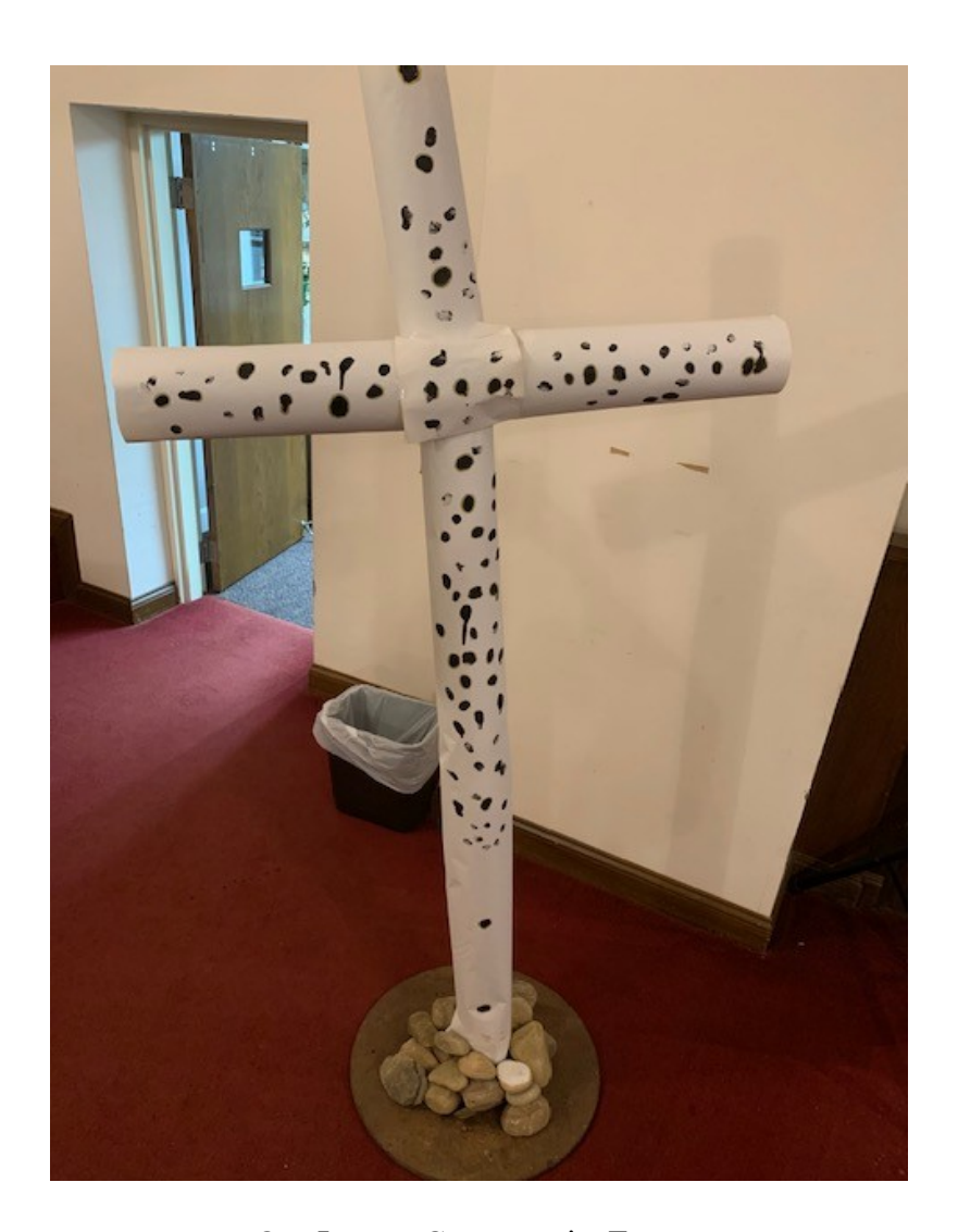
Our Lenten Cross awaits Easter.