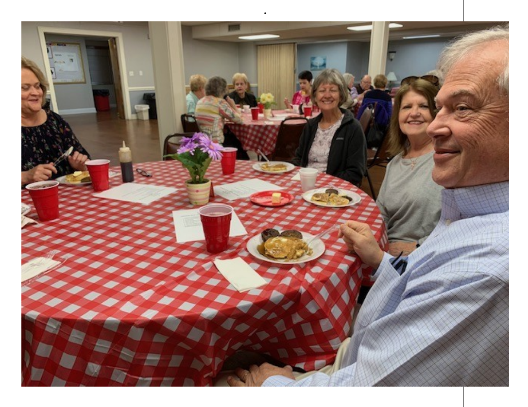
Pancakes on Ash Wednesday. Can't beat it.