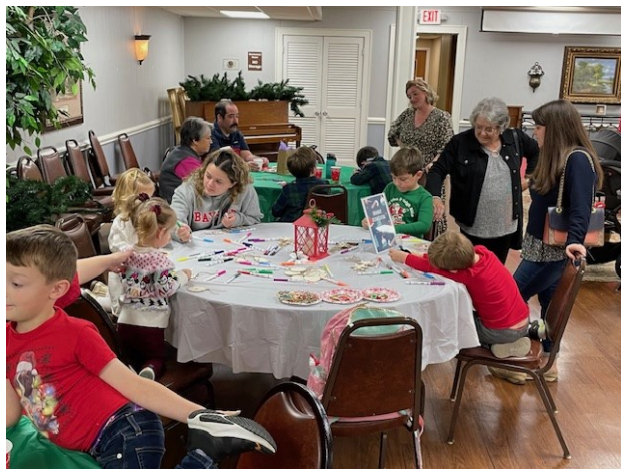
Hanging of the Greens is always a big hit.