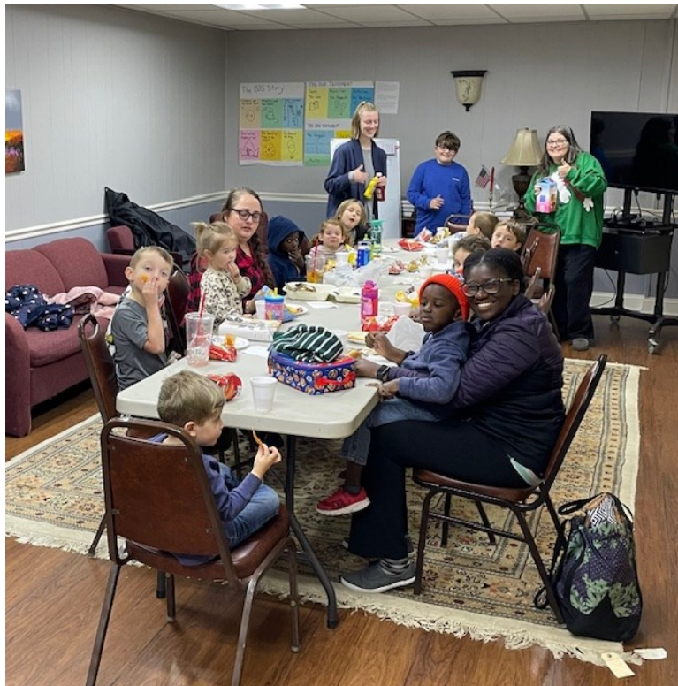
Explorer's Club has grown. They meet every Wednesday evening from 5:30 pm-7 pm. They will be back on January 10 th .