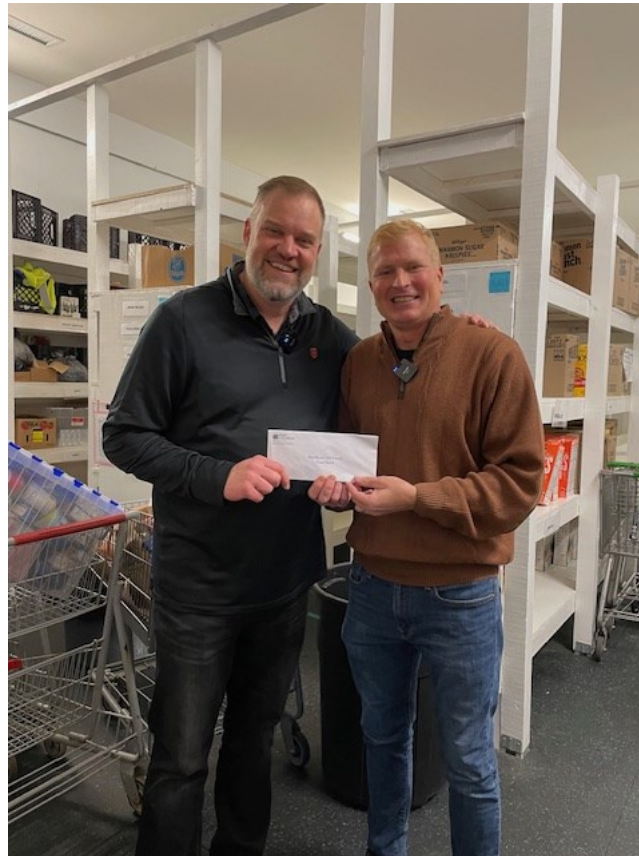
We are thankful to our friends at Rise Church, Red Bank for collecting and donating food and money for the food pantry.