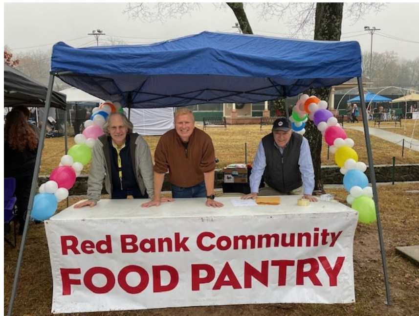
The food pantry had a booth in the park for the Red Bank Christmas Parade.