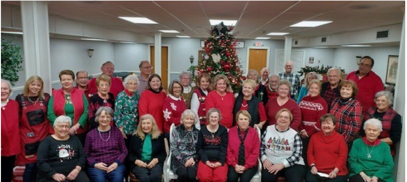
The Young at Heart had a great year and the Christmas Party was no exception.