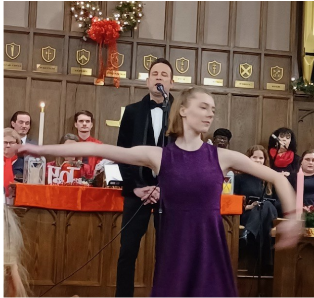
This year's Christmas Cantata was one of our best.