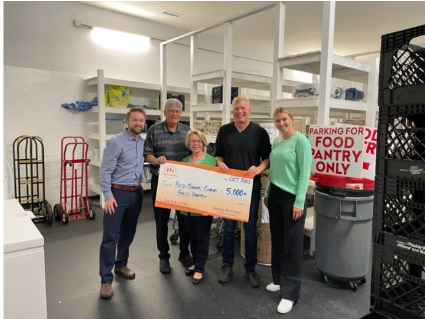
The food pantry was blessed to receive a check for $5,000 from the non-profit arm of Tom Mayberry's company.