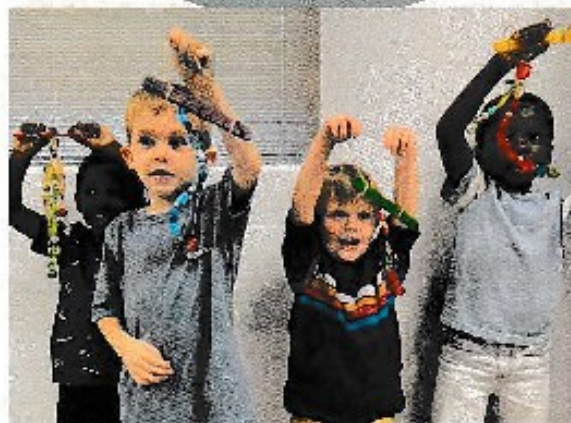
Explorers showing off their wind chimes.

On Wednesday nights we have Explorers Club from 5:30 to 7pm. We kick off every week with dinner, then we have a short lesson followed by a hands on activity that goes along with the lesson. This week we made wind chimes and talked about how even though we can't see the wind, we can hear the way it moves the wind chimes, just like how we can't see God, but we can see how He moves.