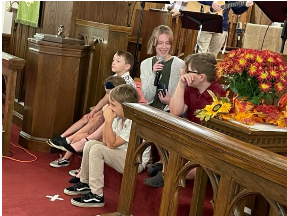
Everyone enjoys Trinity's Children's Message.