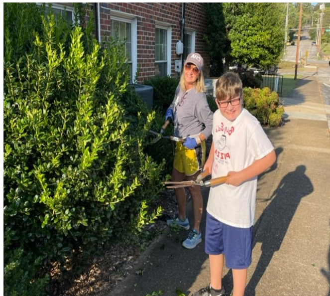
A lot was accomplished at our church workday.