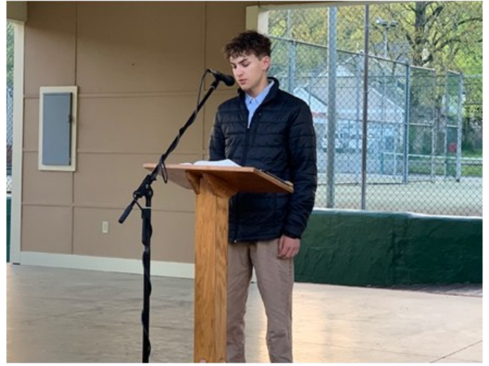
Our Easter Sunrise Service in the Park was a true Resurrection experience.