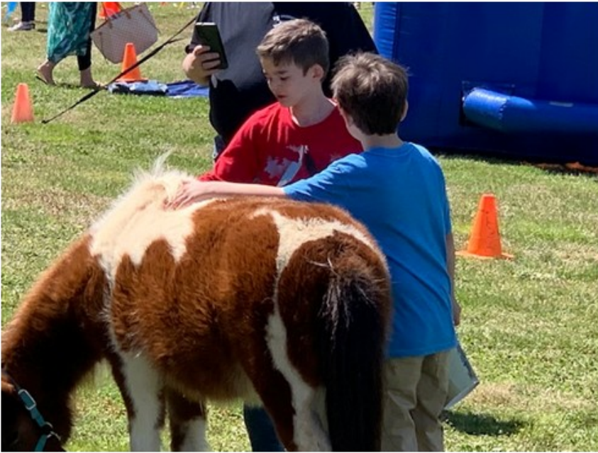
Petting Zoo at The Egg-stravaganza