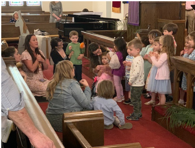
The children processed with palms and sang for us on Palm Sunday.