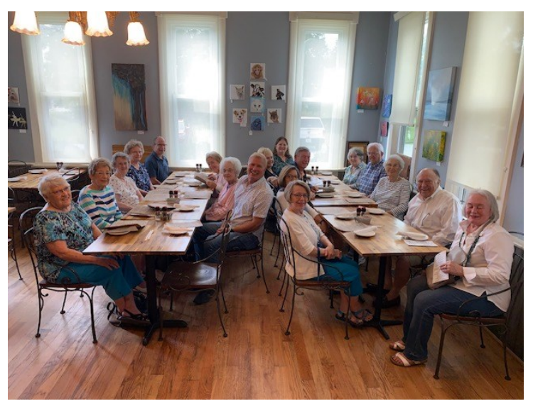
Our Young at Heart Group had a wonderful time eating at the Screen Door Kitchen in Dayton on August 9.

We visit a different restaurant each month and would love for you to come with us!